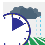
Rain Safe in 2 hours

Application rate is a guide only, use product dilution rate from the table to work out litres of product needed to make the volume of spray that suits your crop.