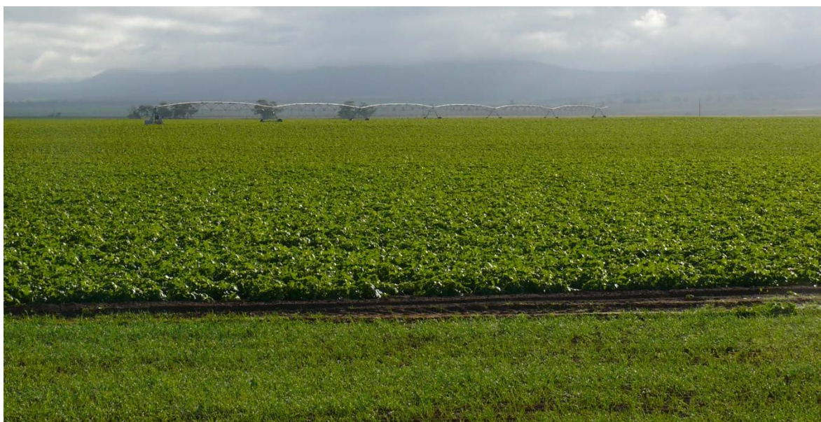
Baroota SA Potato Crop Field

What's particularly interesting is how positive the outcomes were through the use of RLF products in the early days. Today, with our more advanced products we expect these reliable results on a regular basis. But here is a snapshot of what our archival search found.