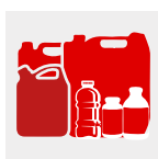
Mix with other Chemicals