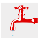
Mix with Water