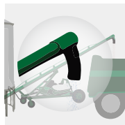
Auger Spray Application