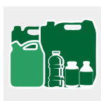
Mix with other Chemicals