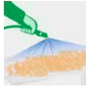
Spray and Mix