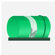
Drum Priming Application