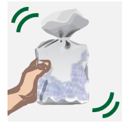
Bag or Packet