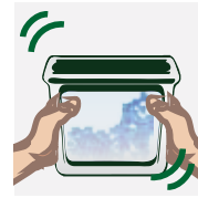
Container or Bucket