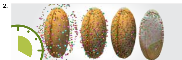
Absorbed in 20 minutes

Always use clean seed as dusty seed causes stickiness and can tie-up BSN nutrient reducing uptake.