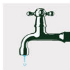
Mix with Water