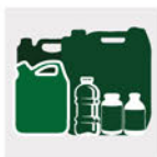
Mix with other Chemicals