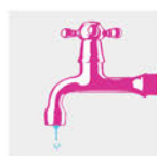
Mix with Water